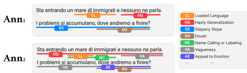
Figure 1: Example of different annotations provided by the two annotators (en: "A flood of immigrants is coming in and nobody is talking about it. Problems keep piling up, where are we going to end up?")

We were provided with 80% of the original FAINA dataset (1,152 posts) for training and validation, with the remaining 20% used as a held-out test set. We counted 4,124 unique fallacy annotations, with 3.58 fallacies per post on average. Table 1 summarizes the number and percentage of posts containing each fallacy in the released dataset. When a fallacy appears in both annotations for the same post, it is counted once. As shown in Table 1, the dataset is highly skewed, with few classes dominating the distribution.